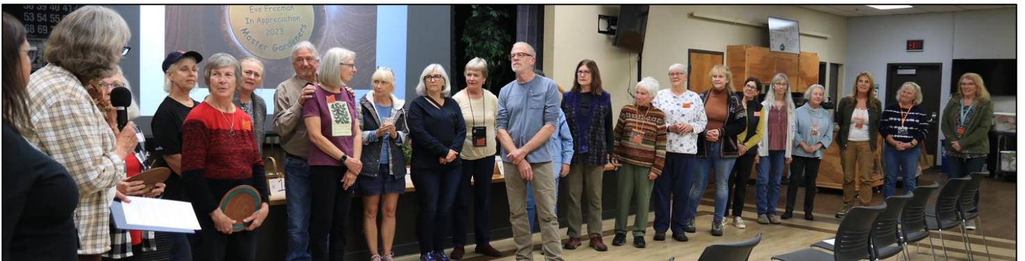
GAER volunteers over the years receive gloves & gratitude from the chapter